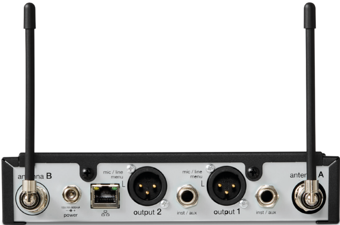
SLXD4D+ Back Panel