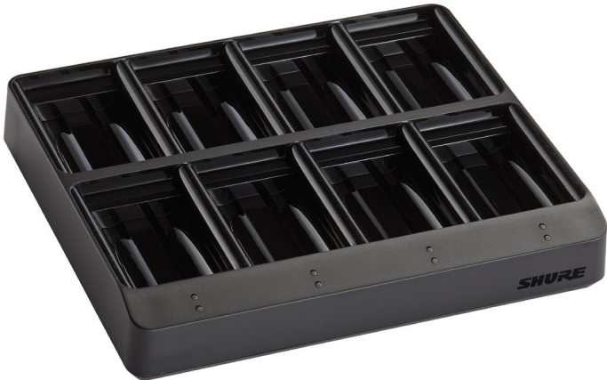
SBC80-903 8-Bay Battery Charger

Recharging station for up to eight (8) SB903 rechargeable lithium ion batteries. The charging cradle is designed to fit in a rackmount drawer and provides a full charge for installed batteries in 3 hours. LED indicators illuminate to indicate battery health and charging status.