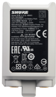
SB903 Rechargeable Lithium Ion Battery