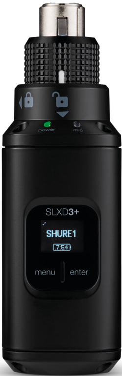
SLXD3+ Digital Wireless Plug-On Transmitter