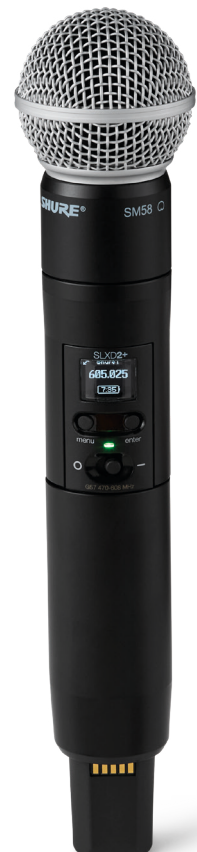
SLXD2+/58 Digital Wireless Handheld Transmitter