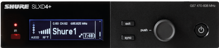
SLXD4+ Front Panel