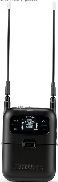
SLXD5+ Single-Channel Portable Digital Wireless Receiver