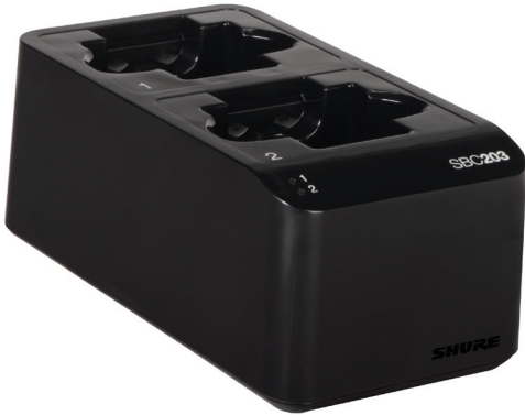
SBC203 Dual-Docking Recharging Station

Dual docking recharging station charges two SB903 lithium-ion batteries in or out of their transmitters. Built to charge two batteries, two body pack transmitters, two handheld transmitters or any pairing of two SLX-D transmitters or SB903 batteries.