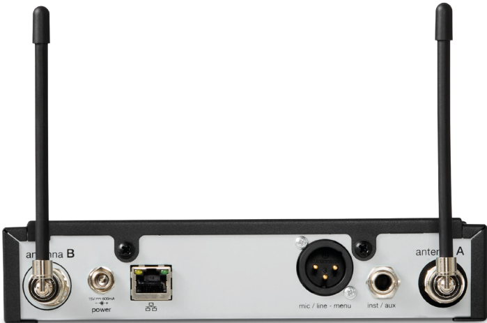
SLXD4+ Back Panel