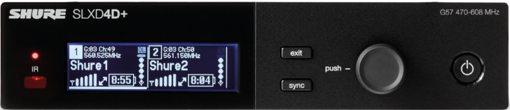
SLXD4D+ Front Panel