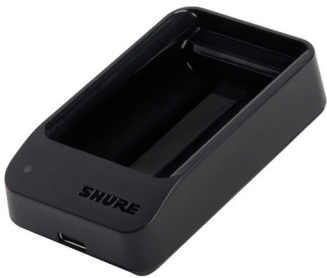
SBC10-903 Single Battery Charging Sled