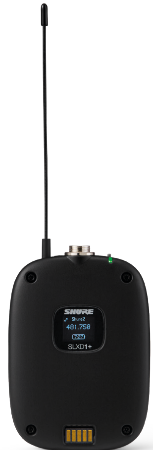
SLXD1+ Digital Wireless Bodypack Transmitter